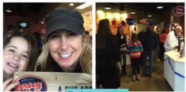
Thanks Jersey Mike's!